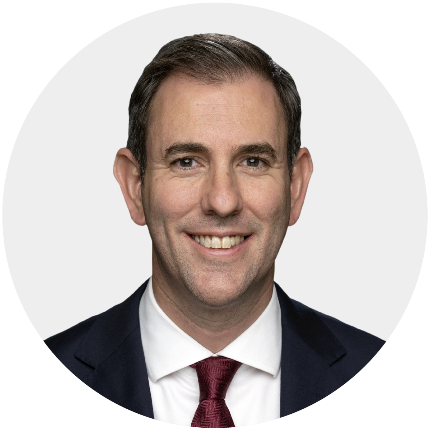
The Hon Dr Jim Chalmers MP Treasurer