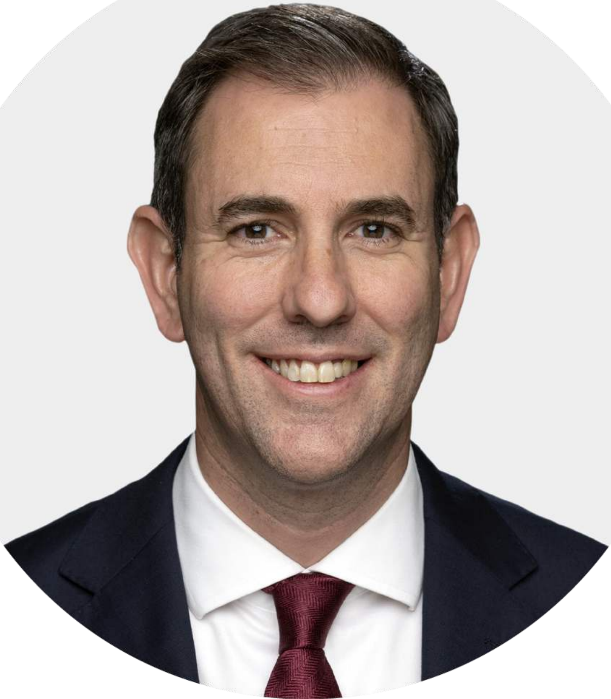
The Hon Dr Jim Chalmers MP Treasurer

The Albanese Government is committed to strengthening the superannuation system so that it is equitable, sustainable and delivers better outcomes for all Australians.