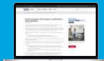
TECHNICAL UPDATE: ATO CHANGES TO WORKING FROM HOME DEDUCTION