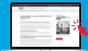
TECHNICAL UPDATE: USE OF AN INDIVIDUAL'S FAME BY RELATED ENTITIES